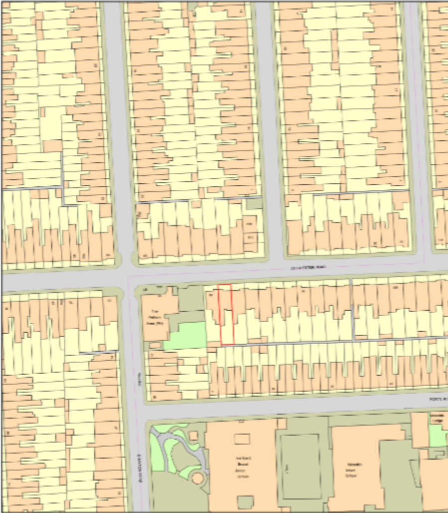
Figure 1 Location plan